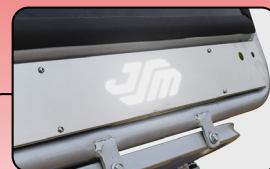
Front Logo Light