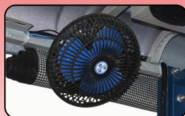
Fan For Driver