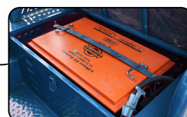
Lithium Battery (Optional)