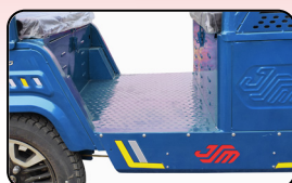
Maximum Leg Space