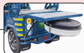
Rear Seat Folding Feature