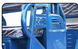
Heavy Drive Arm Rest