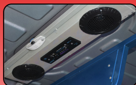
FM Music System